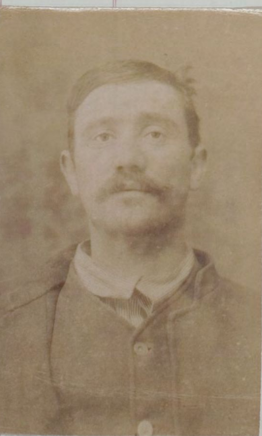
Taken on short sentence 1891