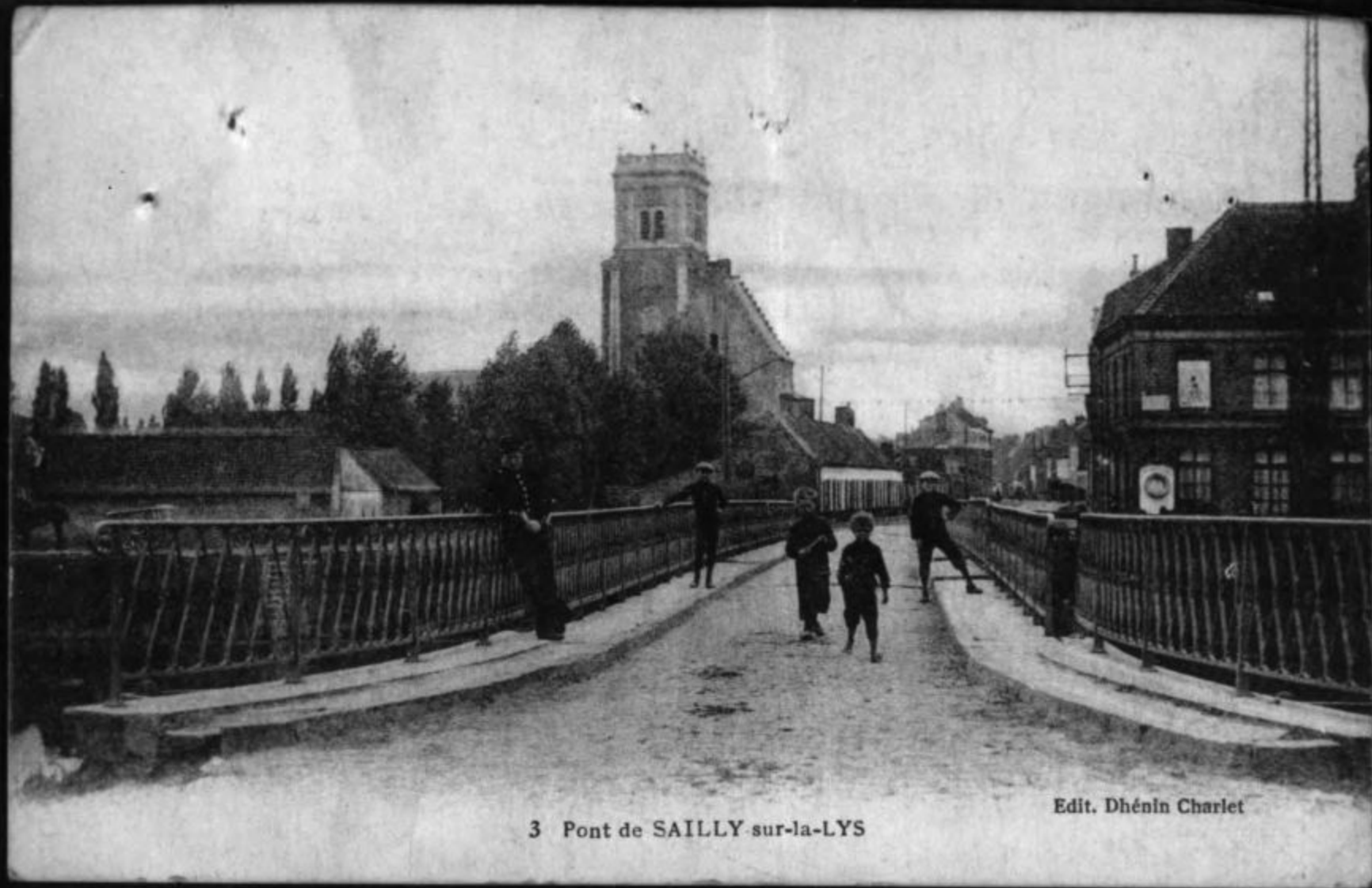
3 Pont de SAILLY-sur-la-LYS