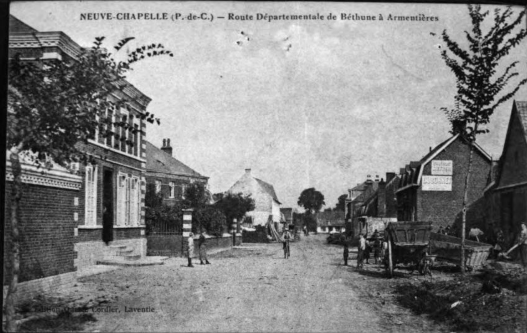
NEUVE-CHAPELLE (P. de-C.) — Route Départementale de Béthune à Armentières